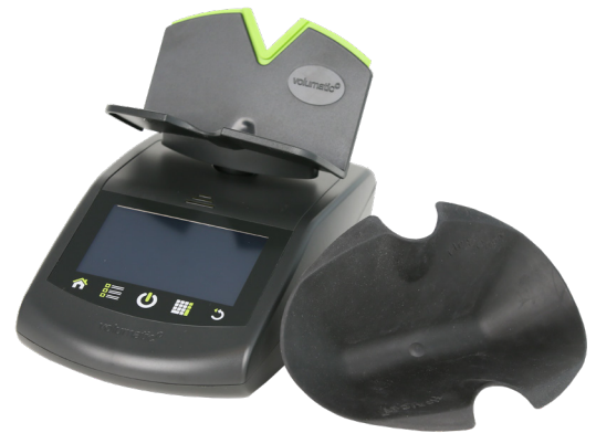
Flexi cup for simplified filling of coinage