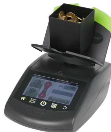
Use with coin cups