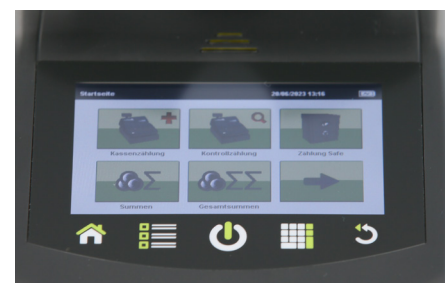
Large display with backlight