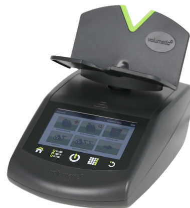
Easy to operate

Counting data can be transferred directly from the CountEasy 2 to a Windows cable directly from the CountEasy 2 to a Windows PC for further processing.