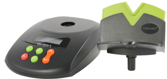
Modular design for space-saving storage and transport