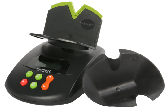
Flexi cup for simplified filling of coinage