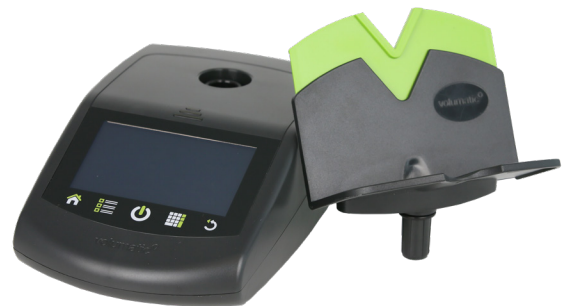
Modular design for space-saving storage and transport