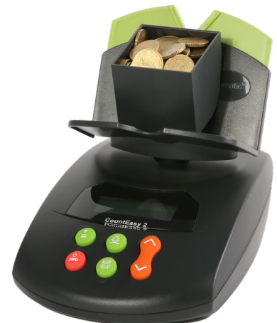
Use with coin cups