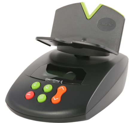
Easy to operate

Count data can be transferred directly from the CountEasy 2 to a Windows PC using the „Connect“ software via the „Connect“ cable and processed there.