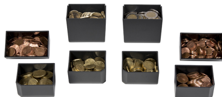
Coin cups for quick and easy counting