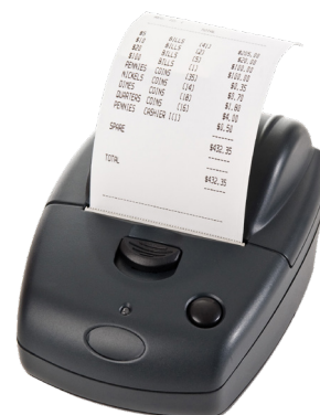
Expandable with a printer