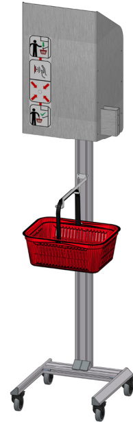
Mobile disinfection station TEKA desinfecto Spray BASKET for shopping baskets