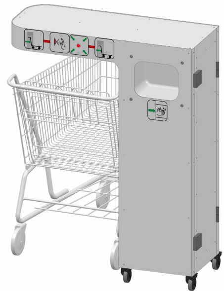
Mobile disinfection station TEKA desinfecto Spray ECO for shopping and luggage trolleys