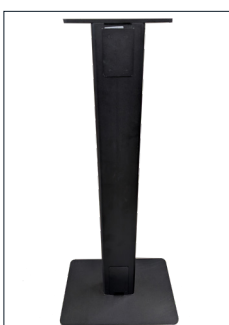
Stand item no.: 58500.001-0070