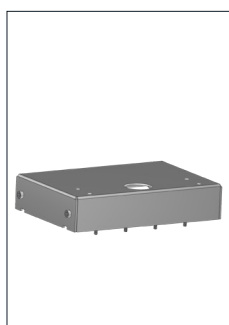
Kiosk surface and ACR mount item no.: 13300.285-00x1