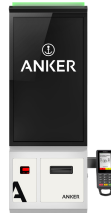
Kiosk in RAL9005 deep black