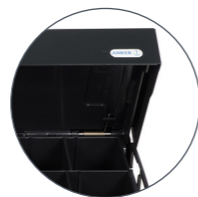
Inner cassette with lid