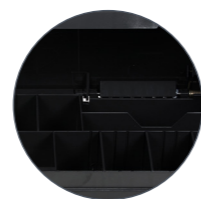
Cassette with 9 coin compartments