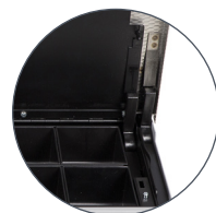
Sturdy metal inner cassette