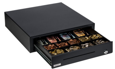
Filled drawer insert