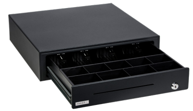
Empty drawer insert

Identical 3-position lock (emergency opening, electrical opening, locked position) incl. 2 locks; random locks on demand